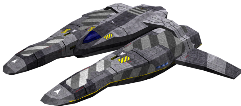
Figure 7.3: Example of the comm graphics for the "Llama".